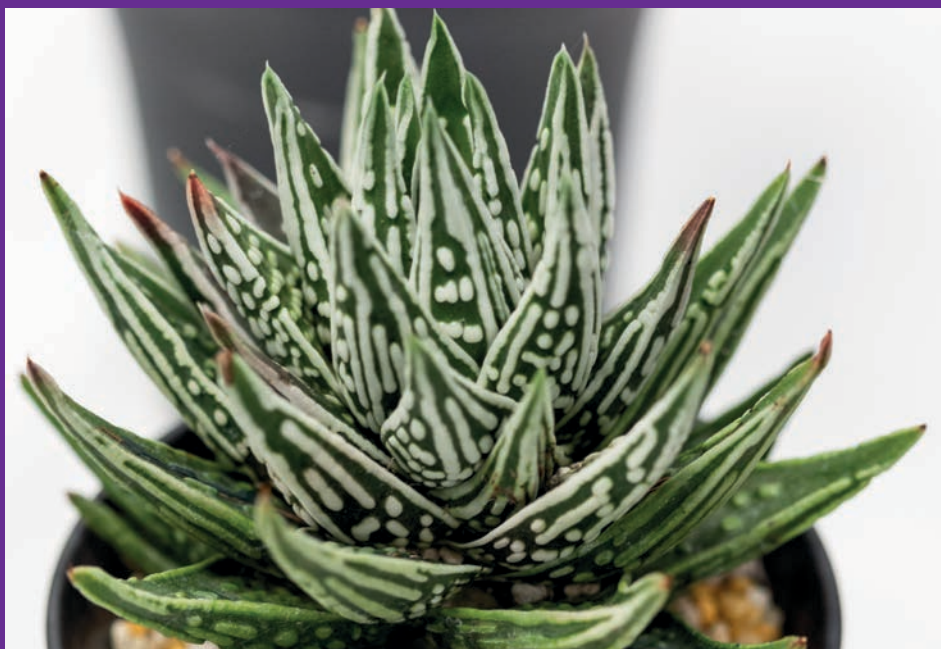
Tulista 'Tears of Angles'